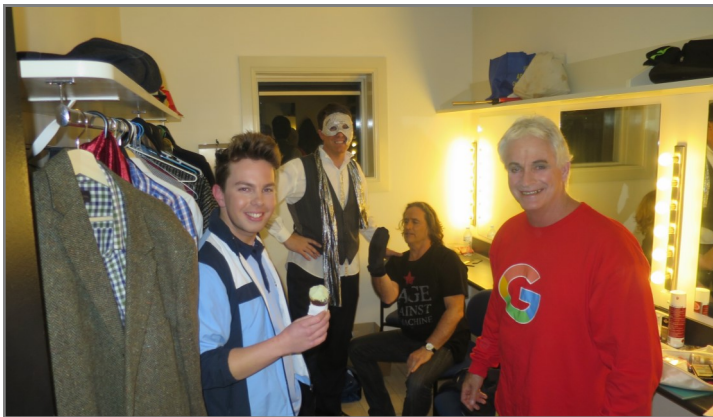
Our new dressing rooms at the Kinema were a hit with the Moruya Red Door Theatre Company actors - well lit and with plenty of storage and hanging areas for all their gear. This was their first use by a drama group.