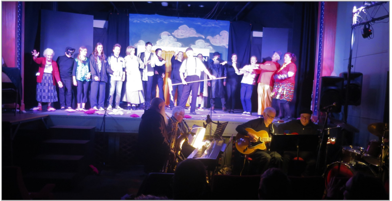
The Moruya Red Door Theatre Company went on tour for the first time in its three year history, first to our Narooma Kinema and then to Central Tilba.

What an exciting time we have had. First the Moruya-based Red Door Theatre Company put the Kinema through its paces as a live theatre venue, the first such use since the recent work by the School of Arts (SOA) to improve the Memorial Hall as a live performance venue. Their feedback has been taken on board by the School of Arts committee.