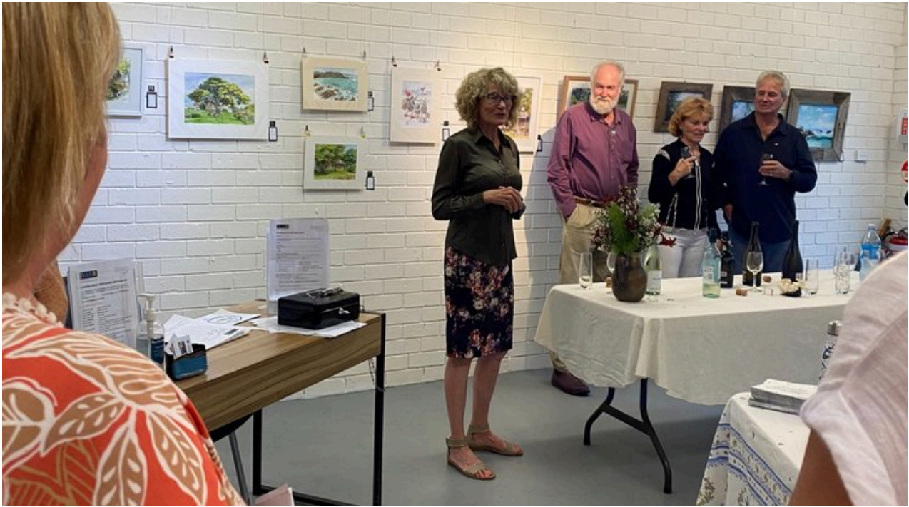
Opening of Postcards from Narooma , at Narooma Gallery

During summer, we hosted two exhibitions at the Narooma Gallery and the timing was perfect to catch the crowds.