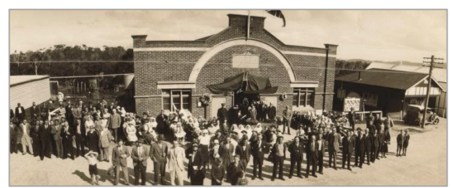
Anzac Day 1935