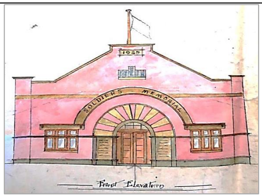
O'Donnell's water colour of proposed 1925 building