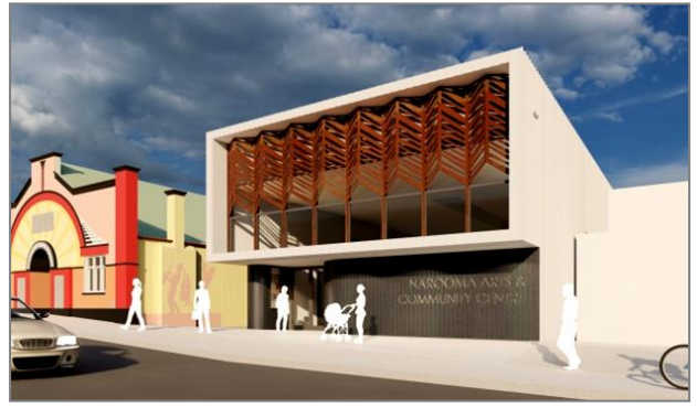
Narooma Arts & Community Centre (NACC) DA approved by Eurobodalla Shire Council