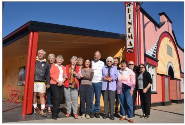
Hall Project completed early 2018 showing some of 'the team'