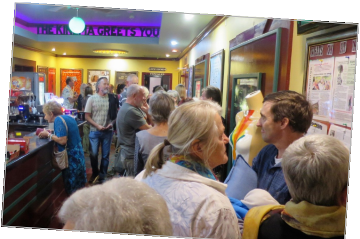
Foyer congestion was an issue